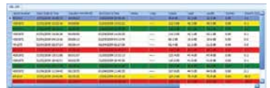
Exposure data can be automatically colour coded according to exceeded action levels

Graphs can be further analysed by adding zones (shown right) which subsequently provides exposure levels inside and outside these zones. This allows the exclusion of extraneous events, breaks etc to provide comparative exposure calculations. Any exclusion zones added to data are retained with the data file.