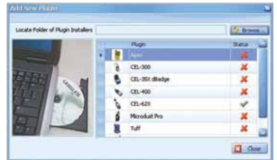
Adding additional instruments

Users of existing Casella software packages can import previously downloaded data. Likewise, data within Casella insight can easily be exported and sent to other colleagues or users, allowing data to easily be shared across organisations.