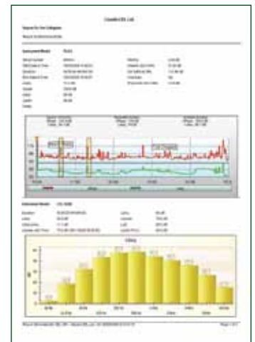
Reports can be generated to include dust and noise results together, for example