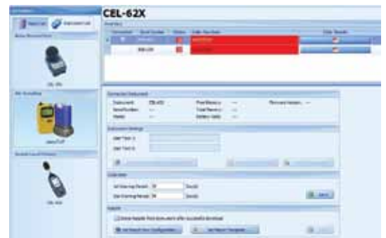
Instrument calibration and configuration screen